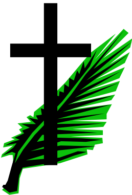
Palm Sunday March 28th